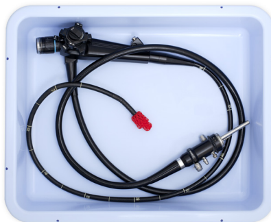
TP-100-03 Distal protection in use with endoscope and 103614A-P transport tray